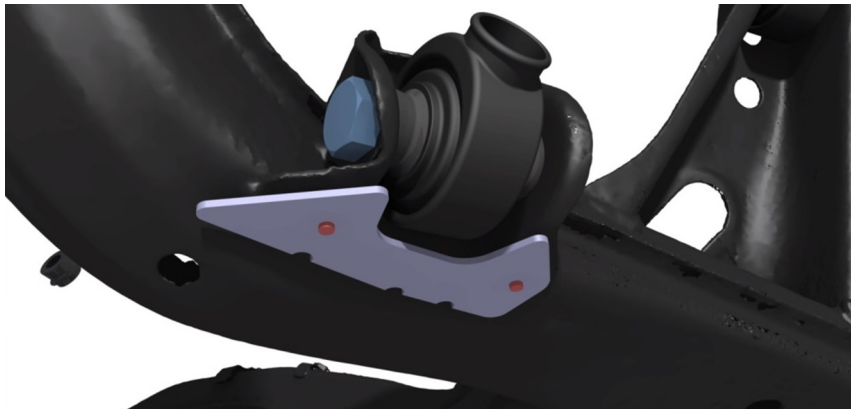
Image 7. Lower control arm rear bracket brace plug welds