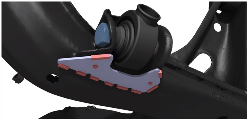
Image 8. Lower control arm rear bracket brace stitch welds