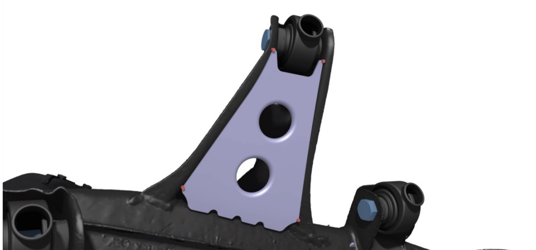
Image 5. Traction arm brace spot welds