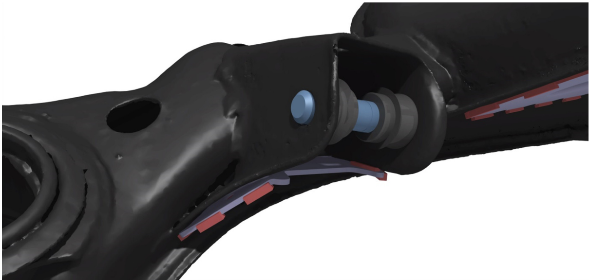
Image 12. Lower control arm front bracket brace inner stitch welds