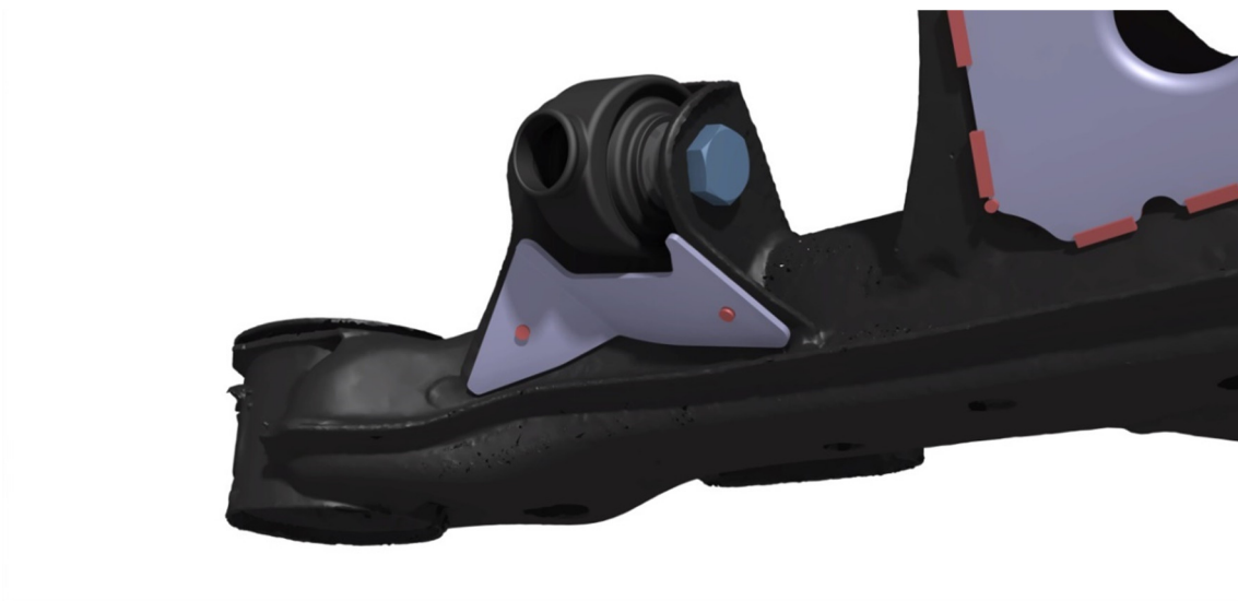
Image 10. Lower control arm front bracket brace plug welds