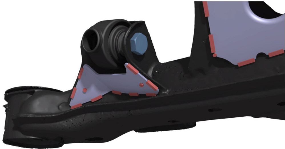
Image 11. Lower control arm front bracket brace stitch welds