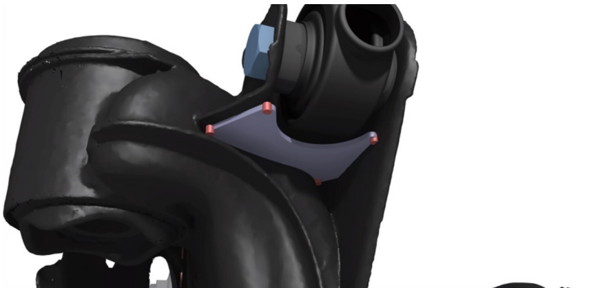
Image 3. Camber arm brace spot welds