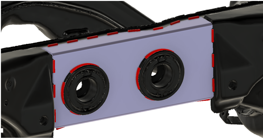
Image 2. Rear differential carrier's brace welding