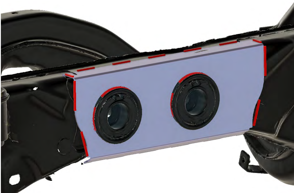
Image 2. Rear differential carrier's brace welding