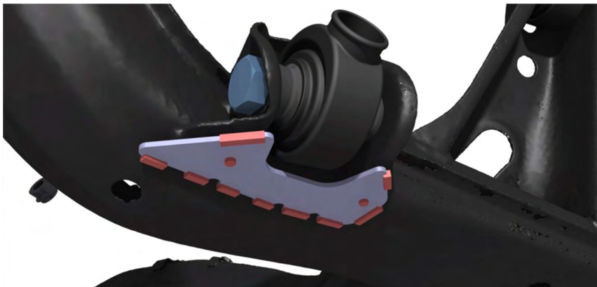
Image 8. Lower control arm rear bracket brace stitch welds