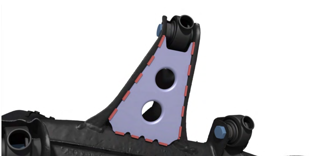
Image 6. Traction arm brace stitch welds