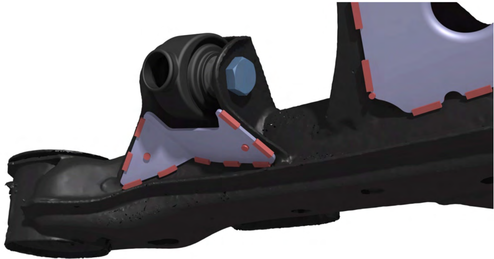
Image 11. Lower control arm front bracket brace stitch welds