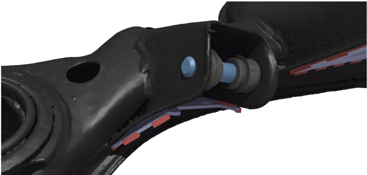
Image 12. Lower control arm front bracket brace inner stitch welds