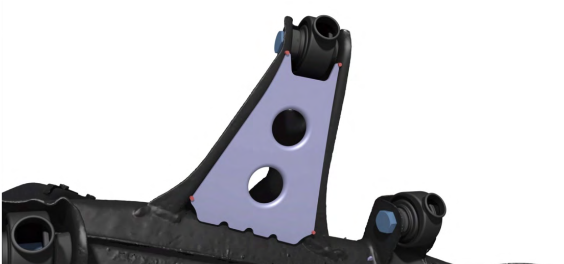
Image 5. Traction arm brace spot welds