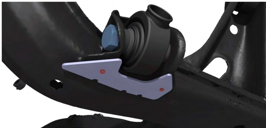
Image 7. Lower control arm rear bracket brace plug welds