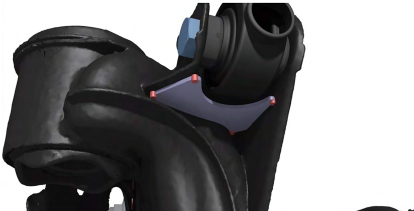
Image 3. Camber arm brace spot welds