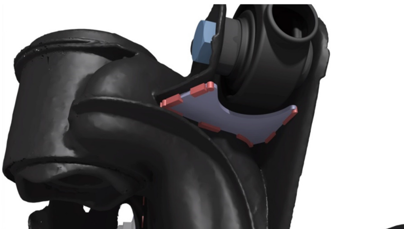
Image 4. Camber arm brace stitch welds