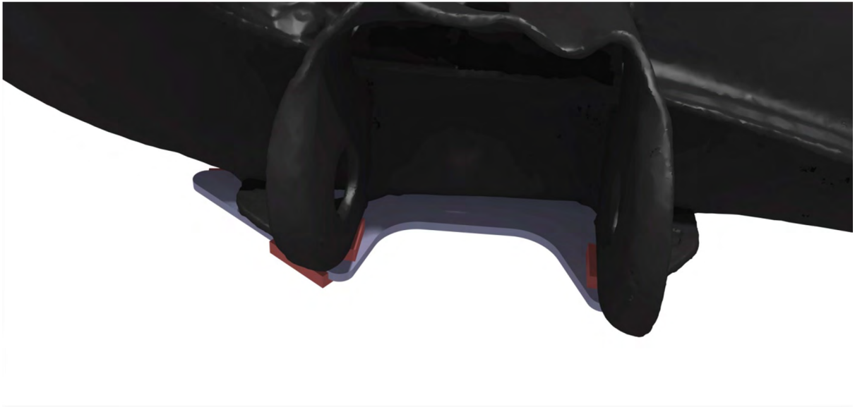
Image 9. Inner welds