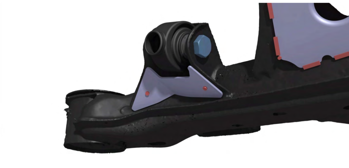
Image 10. Lower control arm front bracket brace plug welds